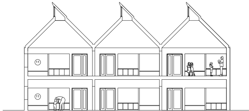
NORTH/SOUTH SECTION B-B